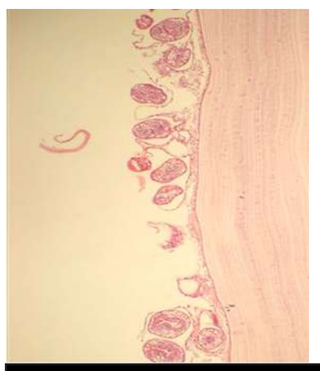
Fig. B: Photomicrograph : Hydatid cyst wall with daughter cysts.H&E. 40X

mean age reported in literature was found to be 25.7 years. Patients are usually farmers or cattle breeders. However, no such history was provided in our case. <sup>10</sup>